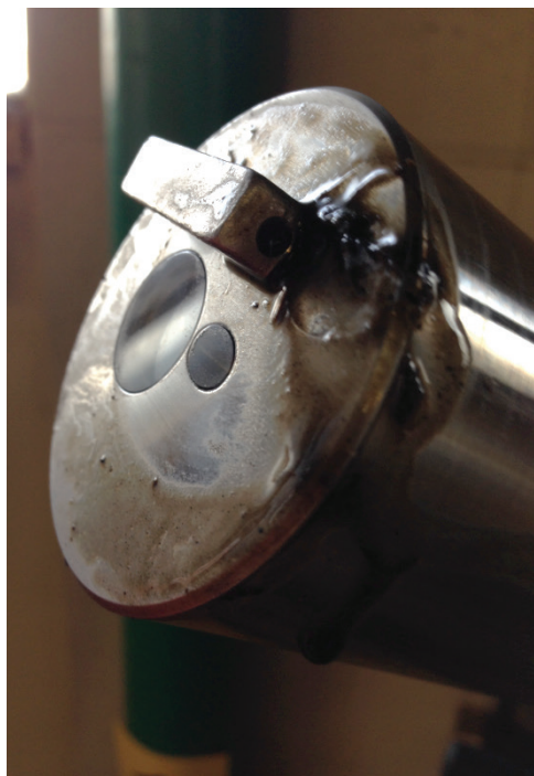
Solitax suspended solids sensor used to measure feed sludge to a centrifuge

“My concerns are meeting permit; having a well-run plant, and giving my guys the right tools so they can do their job with minimal management,” said the WWTP supervisor. “The Hach Real-Time Control system helps us maintain consistency and improve process control.”