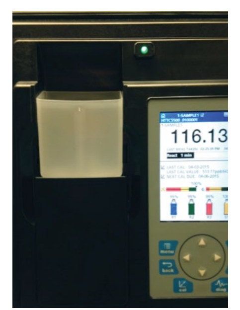
Figure 3 – Grab sample funnel