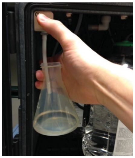
Figure 4 – Grab sample outlet