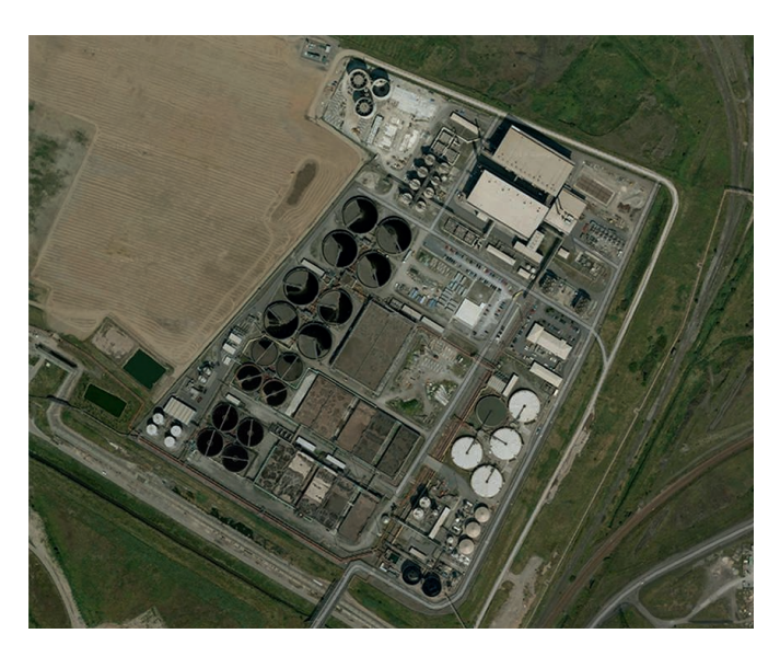
Fig 1: Bran Sands Wastewater Treatment

Hence the objective of the sludge dewatering optimization was to keep the DS content at the desired 18 % and to reduce the polymer consumption.